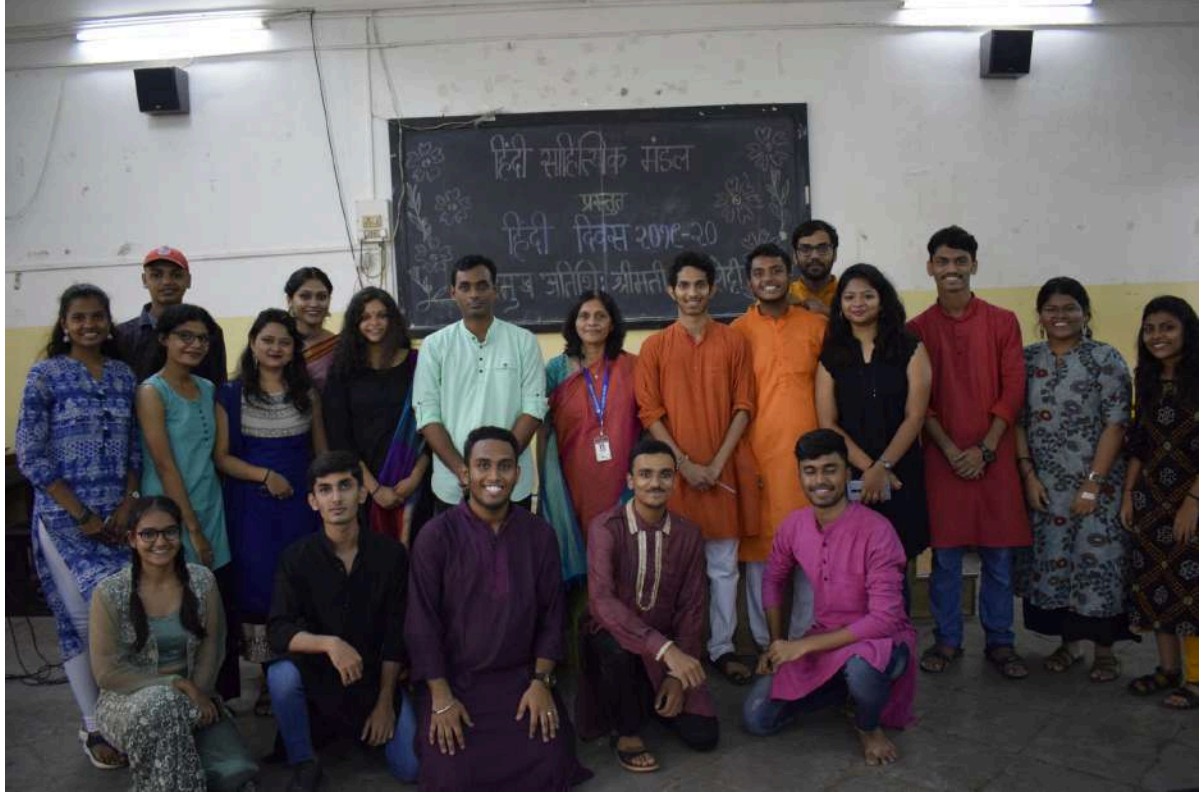
Hindi Diwas Celebration 2019-20