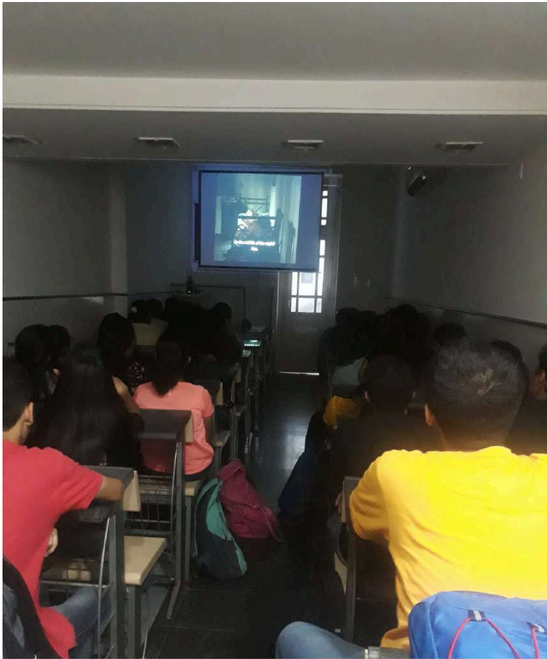
Movie Screening, German Forum, 29th August 2019