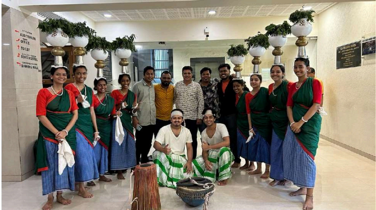
2023 - Dong Sereng Enej (Santhali folk dance )