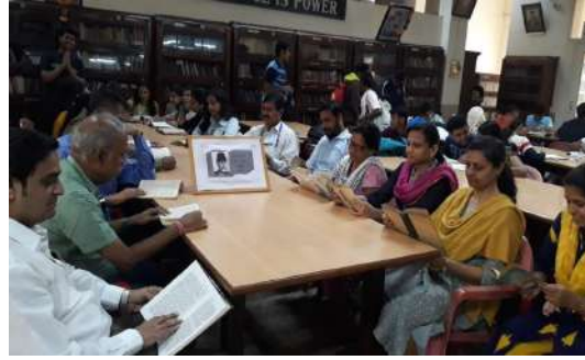
National Education Day (Birth Anniversary of Maulana Abul Kalam Azad) Celebrated in the college on 11th November 2019