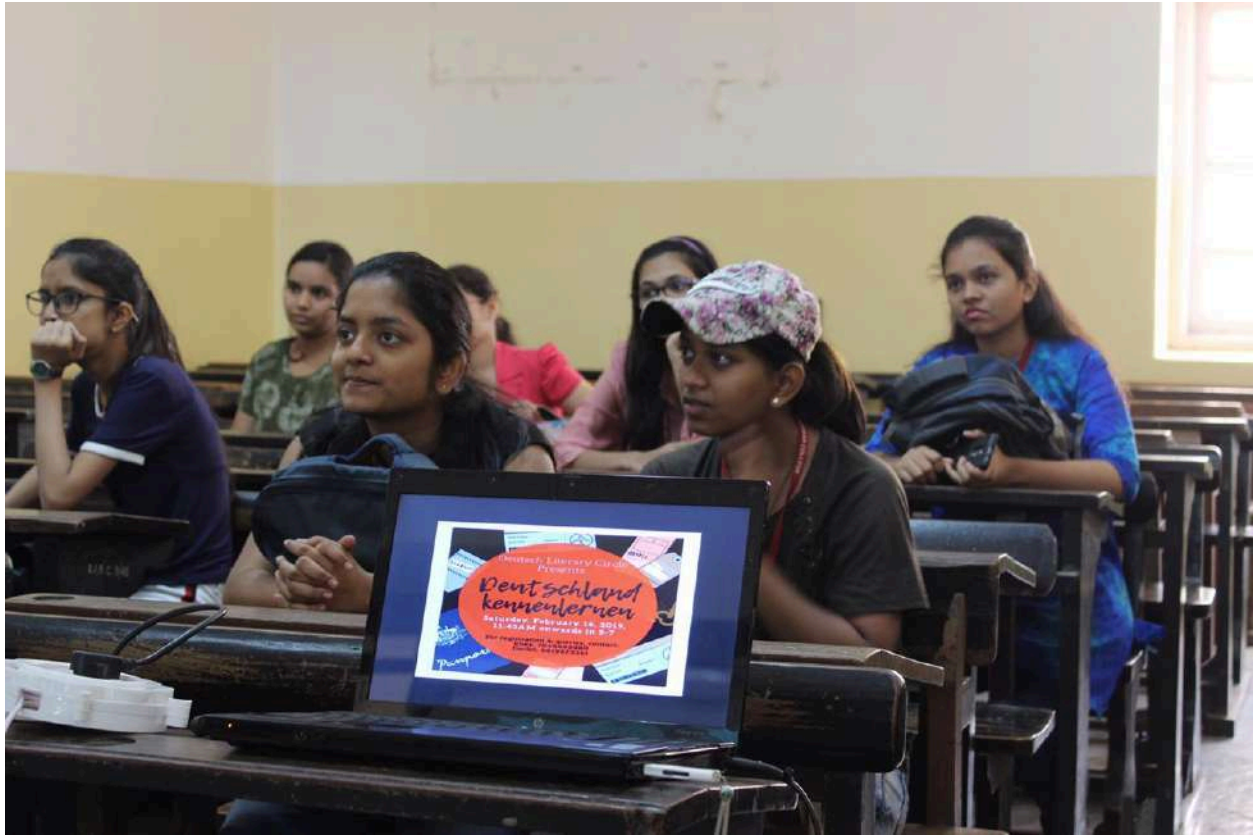
German forum event- Deutschland Kennenlernen DLC - 16th February, 2019