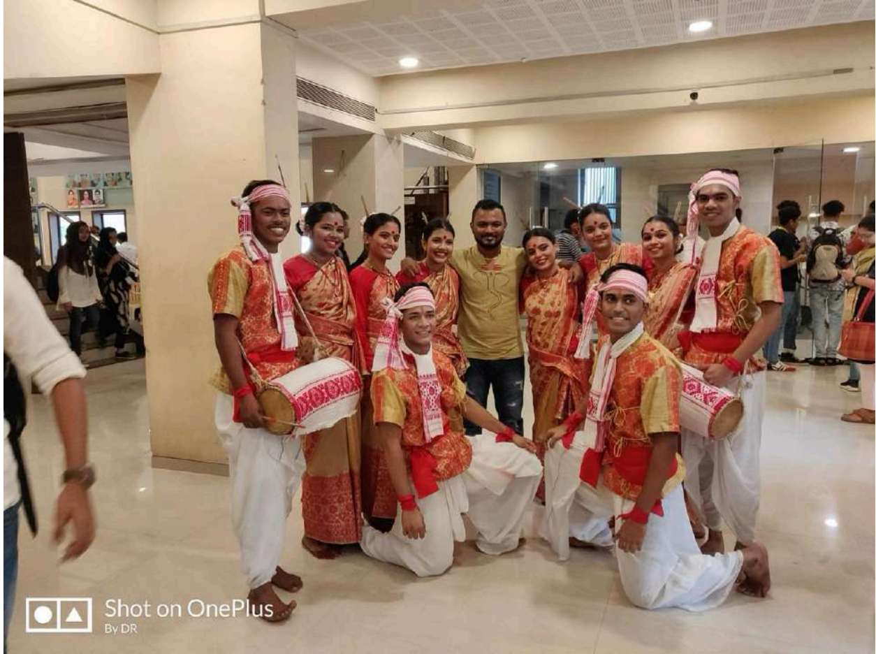
2019 - Bihu from Assam

Podar : Nurturing Intellect, Creating Personalities.