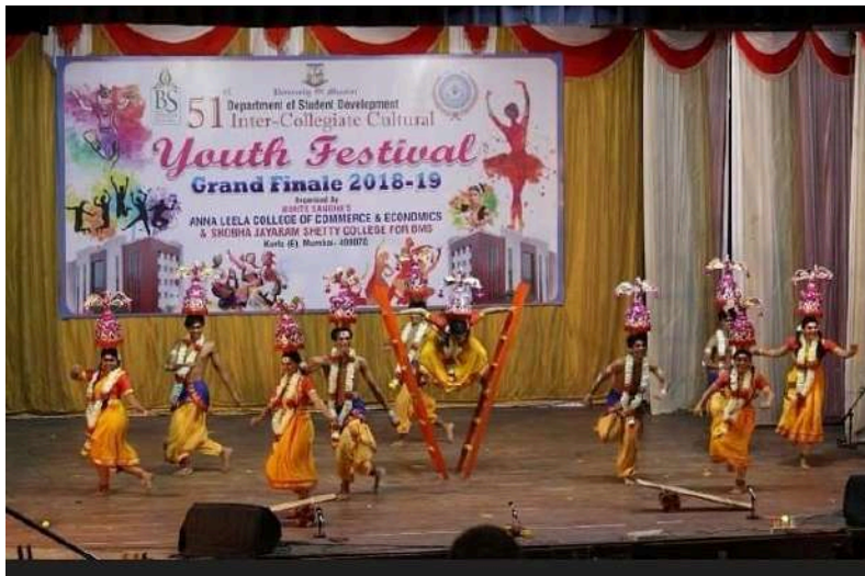
Youth Festival Grand Finale 2018-19

Podar : Nurturing Intellect, Creating Personalities.