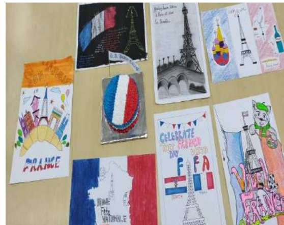
French Forum- Poster-making Competition

Podar : Nurturing Intellect, Creating Personalities.