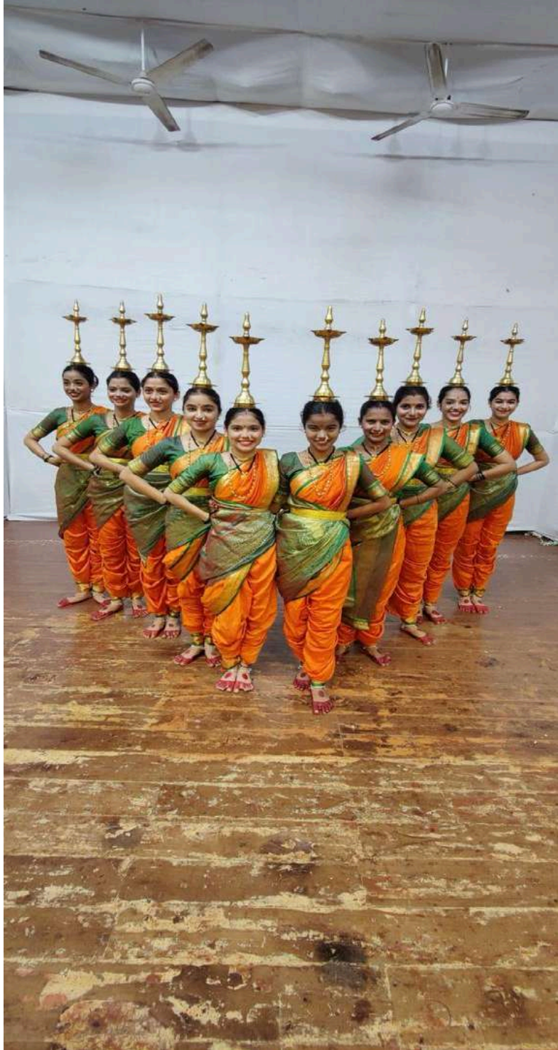
2022 - Divli from Goa

Podar : Nurturing Intellect, Creating Personalities.